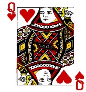
This Photo by

Queen of Hearts Raffle: The Queen of Hearts Raffle will pick up again in the fall! Keep watching for more details – the jackpot will pick up where it left off at $5,340!