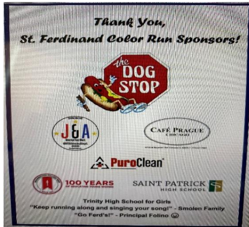
Figure 1 - Don't forget to keep these restaurants, services, and high schools in mind as they all generously supported out 2023 Fun Run!

were huge successes back in June! THANK YOU to everyone who volunteered to help at Summerfest, as well as sponsors of and donators to our Color Fun Run, part of the proceeds of which will be applied toward a future electronic sign for St. Ferdinand School and Parish on Belmont Avenue. Stay tuned to future School Advisory Board Minutes for more updates on that exciting development!